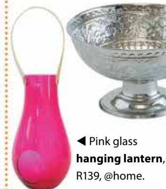
◀ Pink glass hanging lantern, R139, @home.

FABRIC , FROM TOP: Fergus Stripe Canvas, R340,86/m, and Candy Stripe Canvas, R340,86/m, both The Silk and Cotton Company.