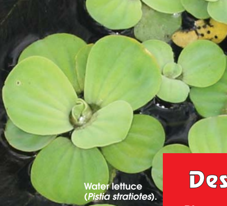
Water lettuce ( Pistia stratiotes ).