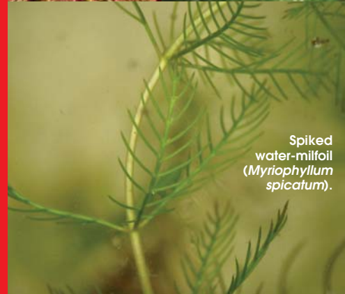
Spiked water-milfoil ( Myriophyllum spicatum ).

For more information on invasive alien plants, go to www.agis.agric.za/wip www.dwaf.gov.za/wf