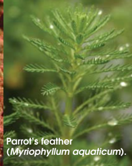
Parrot's feather ( Myriophyllum aquaticum ).