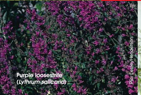
Purple loosestrife ( Lythrum salicaria ).