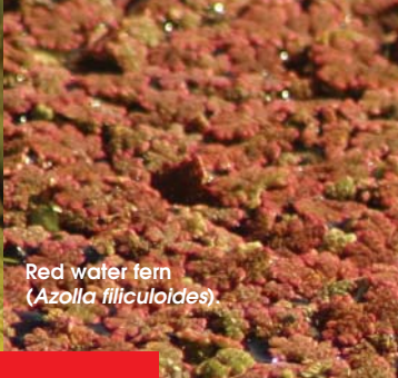
Red water fern ( Azolla filiculoides ).