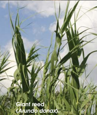
Giant reed ( Arundo donax ).