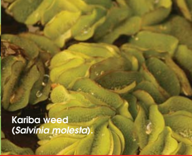
Kariba weed ( Salvinia molesta ).