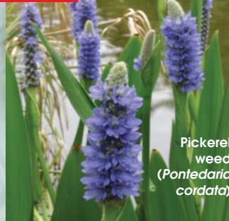
Pickerel weed ( Pontedaria cordata ).