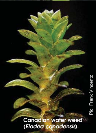
Canadian water weed ( Elodea canadensis ).