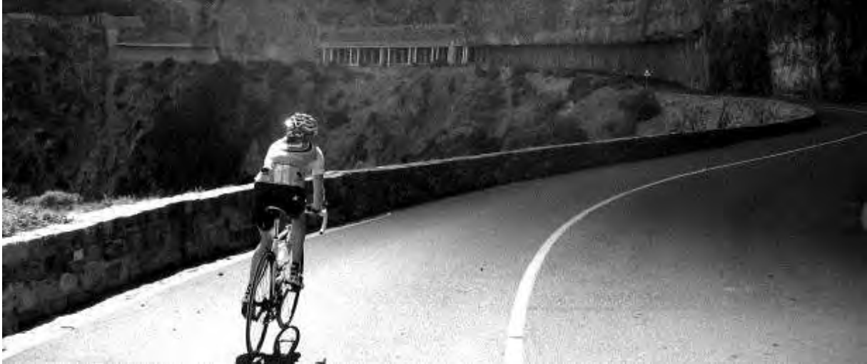
Chapmans Peak curves

Suikerbossie (not too bad really!). From here you enjoy a long descent with magnificent views of Lions Head and the 12 Apostles mountain range before heading into Cape Town passing the trendy beaches of Clifton and Camps bay. Soon you'll find yourself passing the Victoria and Alfred Waterfront and our huge new football stadium before entering the new West Coast cycle lanes which means traffic free riding for 15km! We enter wine country up the last climb of the day before ending at our B&B in Durbanville.