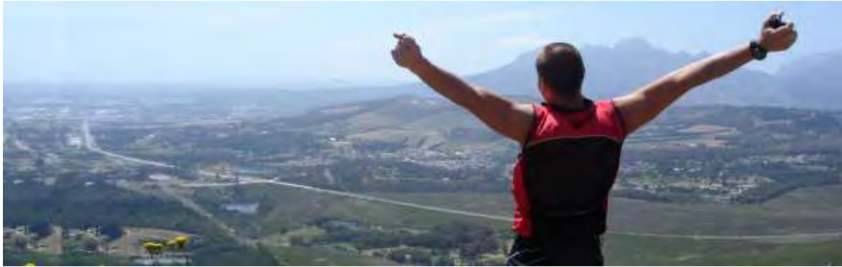
Expect views like this!

We will meet you at the airport and transport you to your 4 star B&B based in Tokai, Cape Town. The afternoon can be spent building up bikes or fitting them if you are hiring one of ours. Of course a pool is available to catch your first rays of the African sun!