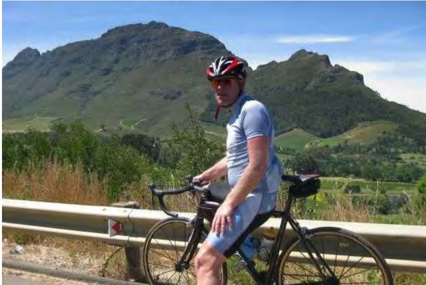
Wine, bikes and mountains

Today we hope that the wind is not blowing! We start heading South through rural farmlands towards the village of Wellington. From here we grind over rolling hills behind the huge granite domes of Paarl (Pearl) before entering the Oak village of South Africa -Stellenbosch