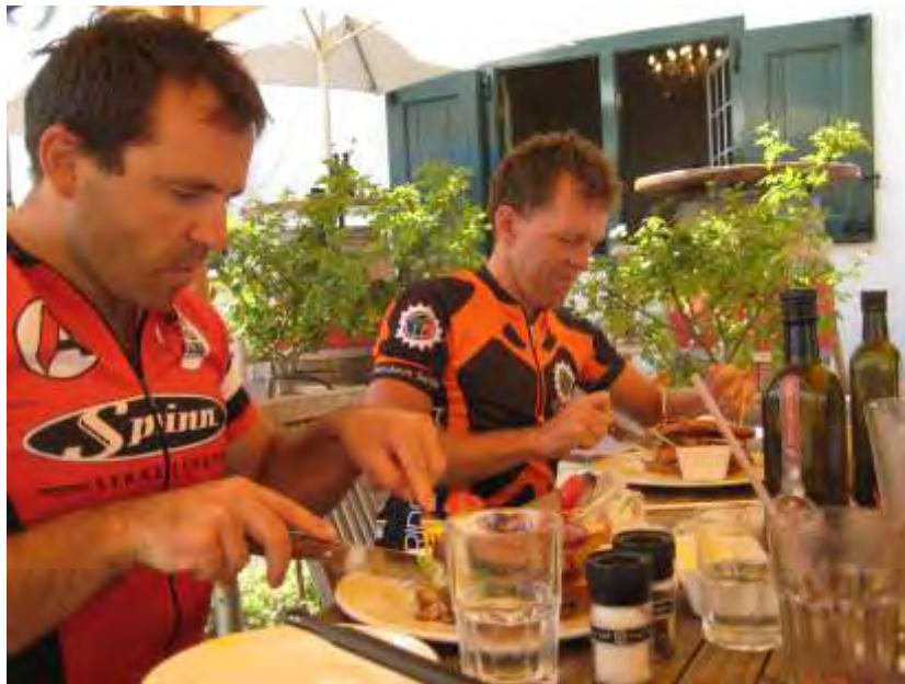
Great food is a highlight of many of our visitors

The legs will feel fresh today and thank goodness for that! We start with a 4km climb of Helshoogte and a descent down the most beautiful wine valley in the region. Good roads speed us along to the French Huguenot village of Franschhoek, where a coffee and cake stop is a must! The cake will give you energy to get up Franschhoek Pass and from here you can enjoy the exhilarating descent through the mountains towards Theewaterskloof Dam. The rest of the ride to the quaint village of Greyton will tax you with its rolling hills but you will be inspired by the beauty of this area!