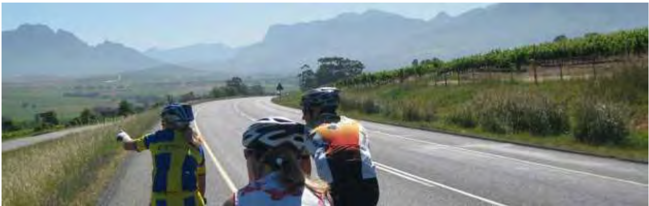
Heading into the mountains. Local knowledge and advice en route!

We start riding Northwards through the 'The Black Lands', so called because of the appearance of the endemic Renosterbos in the region. The wide fertile plain is the bread basket of Cape Town with its wheatfields reaching up to the foot of the mountains, interrupted by wine, fruit and vegetable farms. No major climbs today and hopefully the wind will aid us into the Historic town of Riebeeck Kasteel.