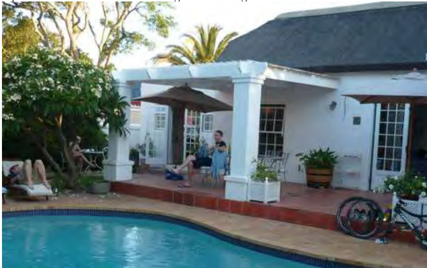
It's OK to relax!

Today can be set aside to rest the legs and either go on a Safari day trip (1,5 hours' drive from Stellenbosch), walk around or just relax, do a cycling oriented wine & chocolate tour (just 35km of cycling!), or maybe do some mountain biking at the magnificent Jonkershoek trails.