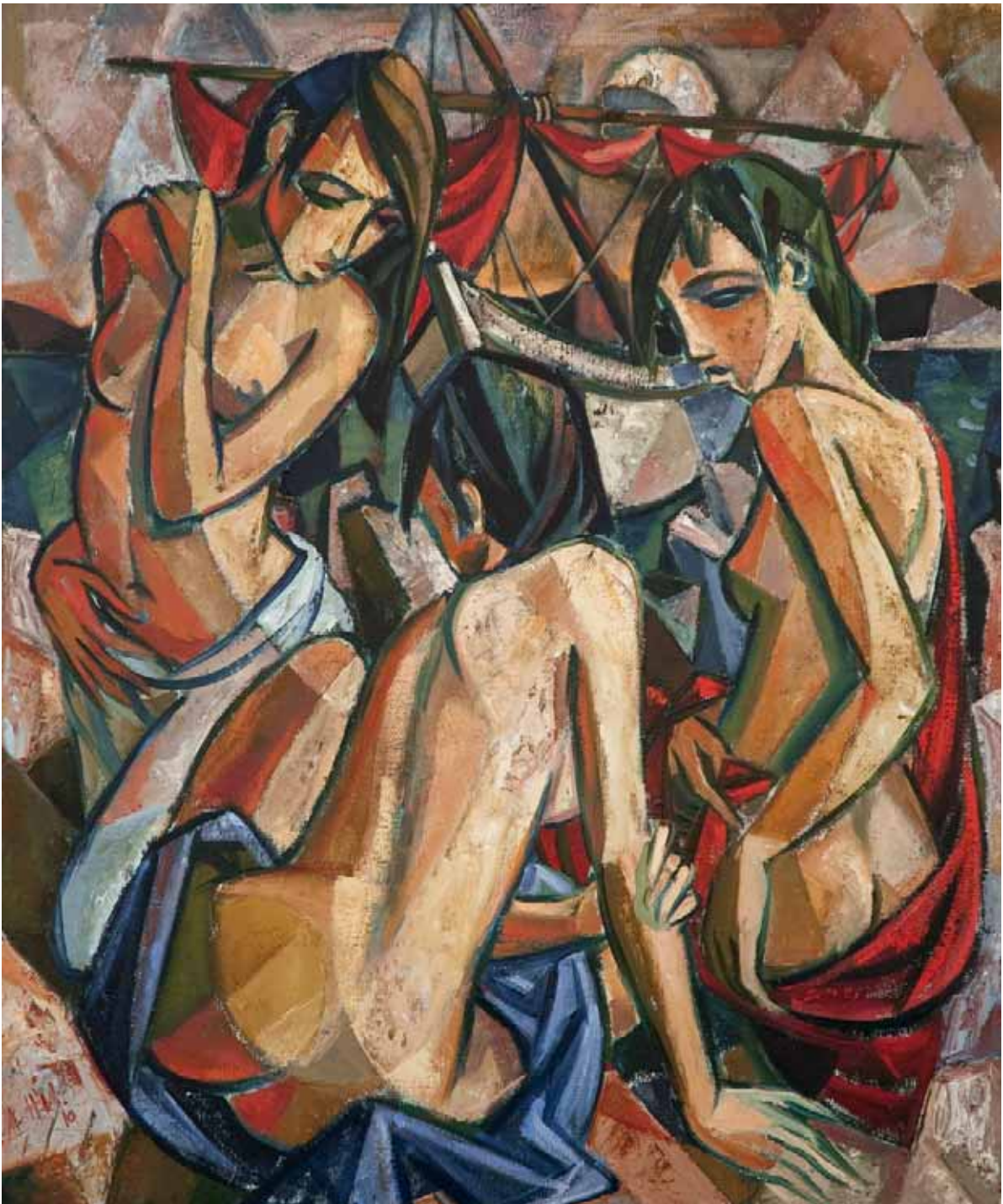
21. The Sirens Oil on canvas 2011 120 x 100 cm RESERVE: R 150,000 DEADLINE: 17h00 Fri 6 May