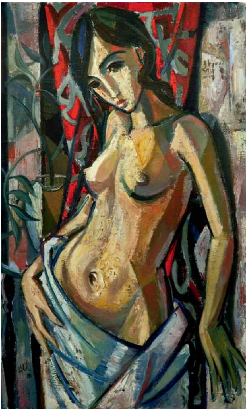
11. Nude Oil on canvas 2010 100 x 60 cm RESERVE: R 80,000 DEADLINE: 14h00 Thu 5 May