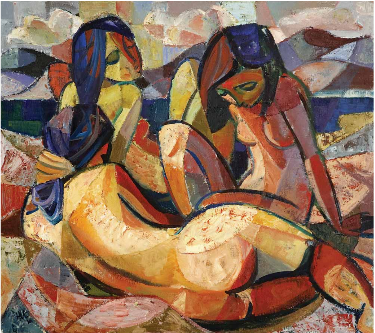
14. Three bathers Oil on canvas 2010 80 x 90,5 cm RESERVE: R 120,000 DEADLINE: 17h00 Thu 5 May