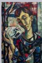
4. Alas, poor Yorick!