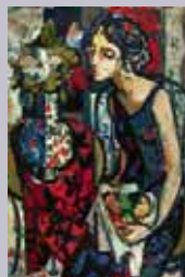
2. Seated woman