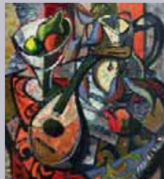
9. Still life with mandolin