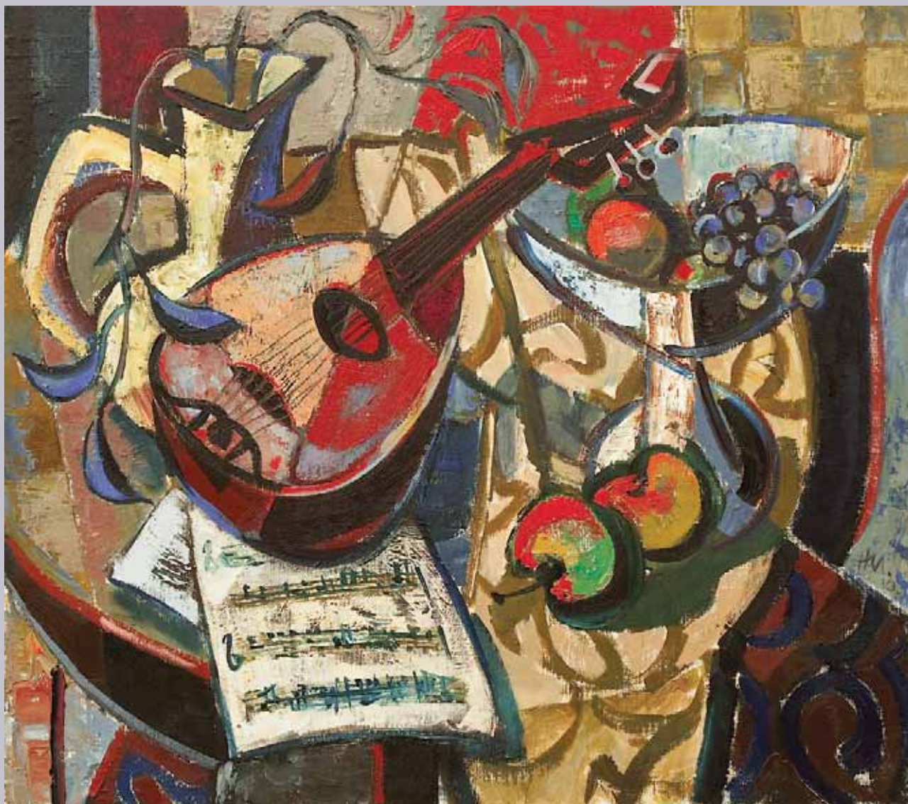
21. Still life Oil on canvas 68 x 76,5 cm Sold for R185 000