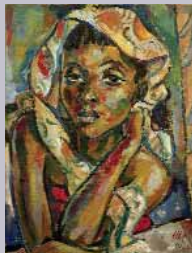
8. Mozambique shopkeeper