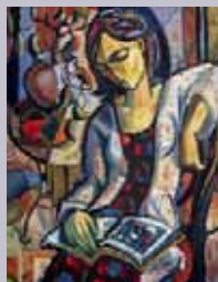
12. Seated woman reading