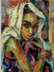
15. Pensive woman I