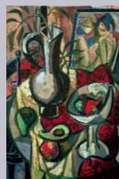
5. Studio still life