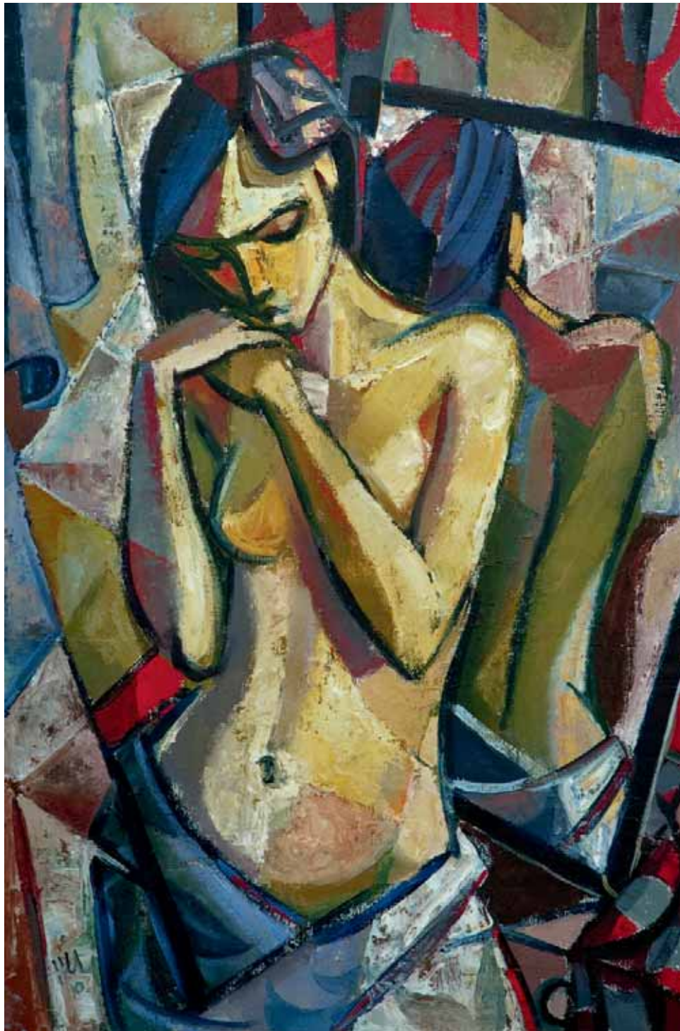
18. Pensive nude