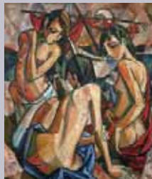
21. The Sirens