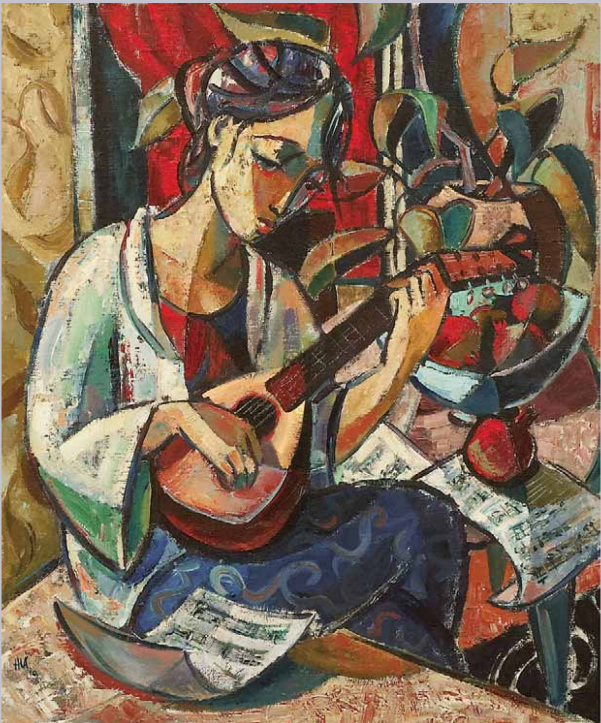
20. Woman with lute Oil on canvas 110 x 90,5 cm Sold for R230 000