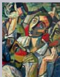
7. The one that got away