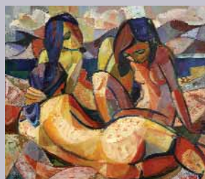
14. Three bathers