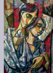
17. The expecting couple