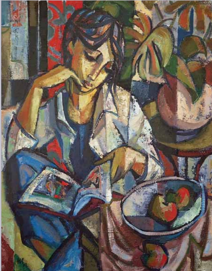
16. Seated woman Oil on canvas 90,5 x 70 cm Framed size: 111 x 91 cm Sold for R205 000