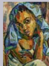
3. The blue scarf