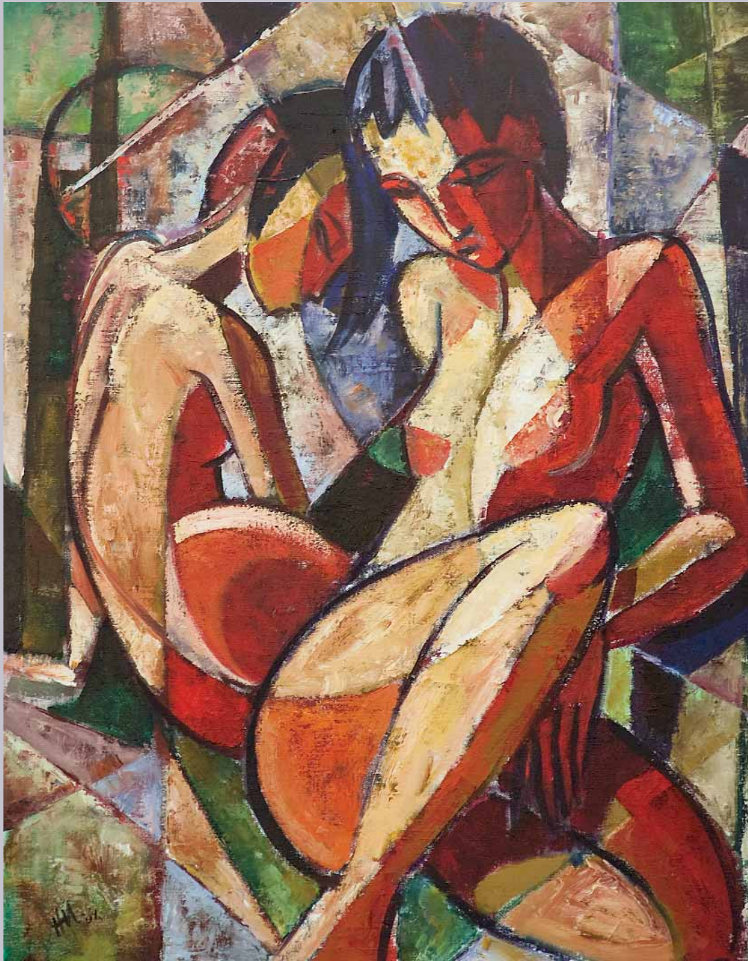
19. Nudes Oil on canvas 90 x 70 cm Sold for R225 000