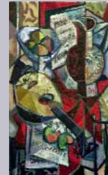
20. The Musicians table