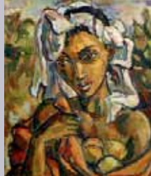
16. The white scarf