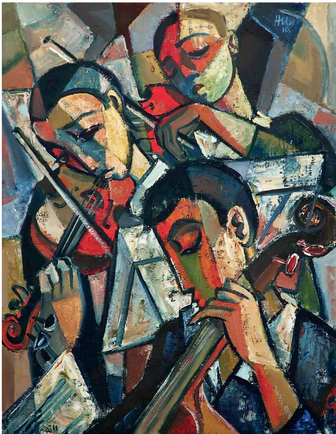
13. String trio Oil on canvas 2010 90 x 70 cm RESERVE: R 70,000 DEADLINE: 16h00 Thu 5 May