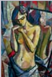
18. Pensive nude