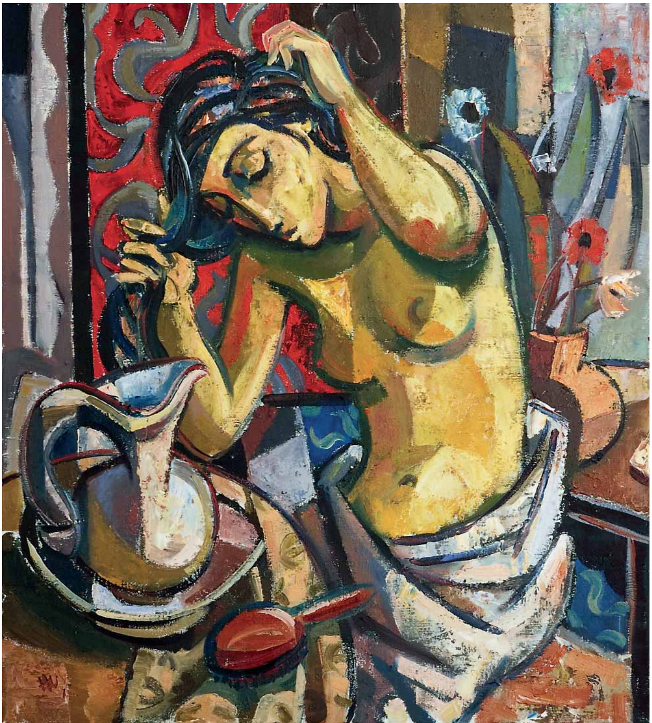
6. Woman washing hair Oil on canvas 2010 90,5 x 80 cm RESERVE: R 80,000 DEADLINE: 16h00 Wed 4 May