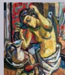
6. Woman washing hair