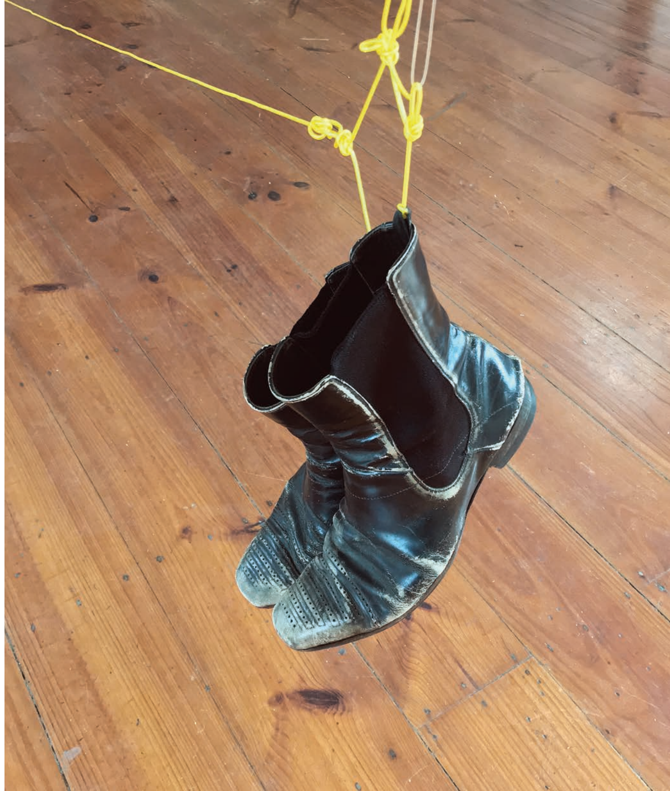
He's Hung up his Boots detail