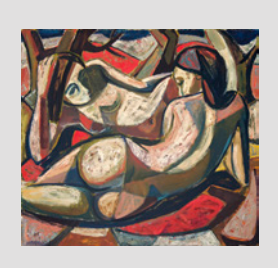
5. In conversation 1 OIL ON CANVAS 2011 100 x 110 CM RESERVE: R 120,000 DEADLINE: 15h00 Friday 30 March