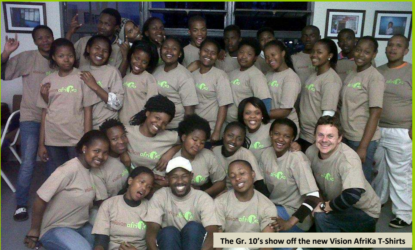
The Gr. 10's show off the new Vision AfriKa T-Shirts